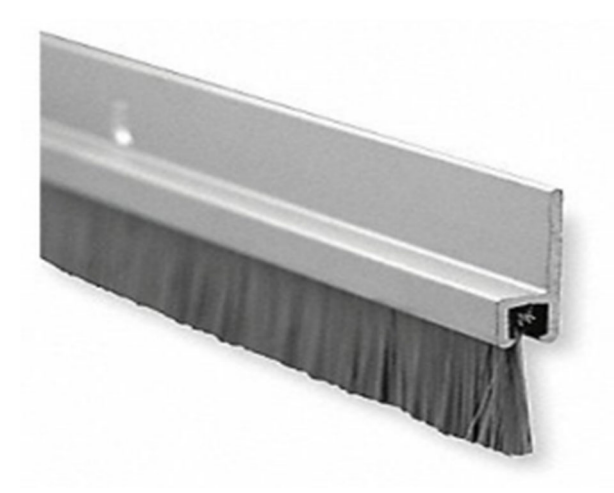
Figure 2: Example Door Sweep

Install door sweeps and replace failed gaskets between doors and frames. Ensure that door sweeps are properly installed and create a good seal without interfering with door operation. It is recommended that door sweeps and seals be inspected regularly for proper fit and damage.