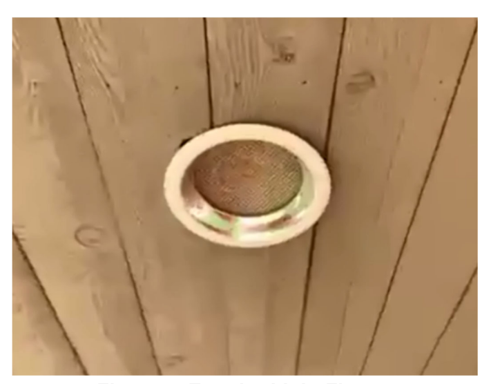
Figure 5: Exterior Light Fixture

Exterior lighting consists of recessed down lights with 13 watt compact fluorescent lamps underneath the covered walkway on the north side of the building.