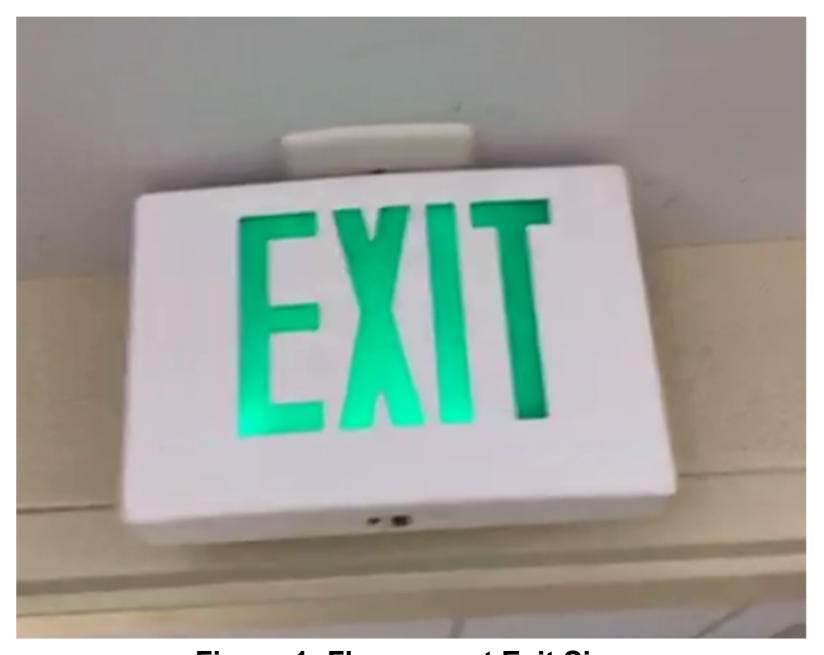
Figure 1: Fluorescent Exit Sign

The existing exit signs in the DHHL space are illuminated with fluorescent lamps. Exit signs in the Association space are not illuminated and the conditions in the OHA space are unknown.