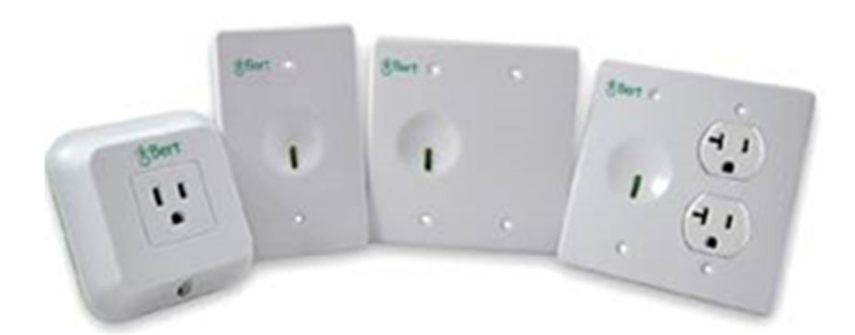
Figure 9: Example Smart Outlets and Sensors

The savings shown are based on 8% plug load energy savings and the cost estimate accounts for a total of 18 outlets to be located in offices, conference rooms, kitchenettes, and workspaces throughout the building.