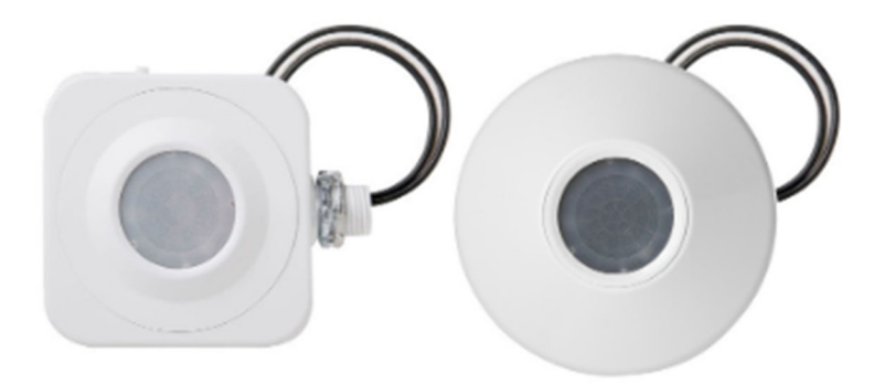
Figure 8: Example Ceiling Mounted Photocells

This ECM should be coordinated with an interior lighting upgrade to ensure that the LED lamps, drivers, and/or fixtures being installed are compatible with dimming controls.