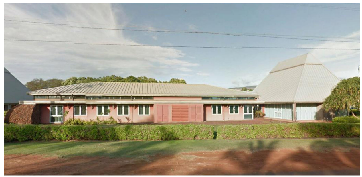
Figure 6: Building Exterior from the South

The windows are generally fixed vinyl frames with clear single pane glass. The main conference room in the DHHL space has floor to ceiling windows facing south-east and south-west. Additionally, there are clerestory windows around the perimeter of the building. Despite some overhangs above the south aspect of the building, the windows are a source of solar heat gain in the building and cause increased cooling loads.