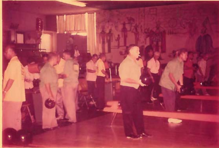
Warm-up for the Monthly "Ace" held each 4th Sunday at B-O-D.

architecture ■ preservation ■ planning ■ interiors